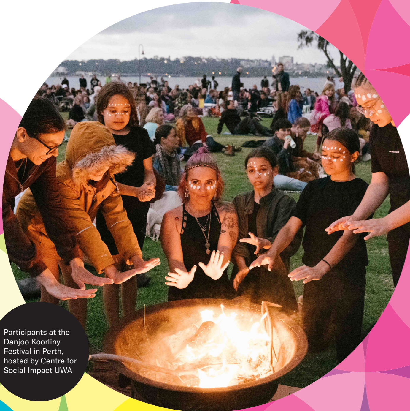
Participants at the Danjoo Koorliny Festival in Perth, hosted by Centre for Social Impact UWA

Being at the forefront of purpose-led research and transformative education, the Centre for Social Impact is dedicated to sharing insights and evaluations on how to drive social reform and build the capacity of the non-profit sector.